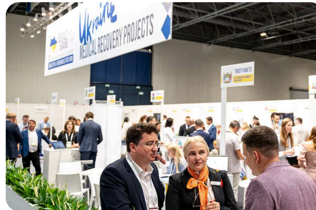
Direct pitching to donors