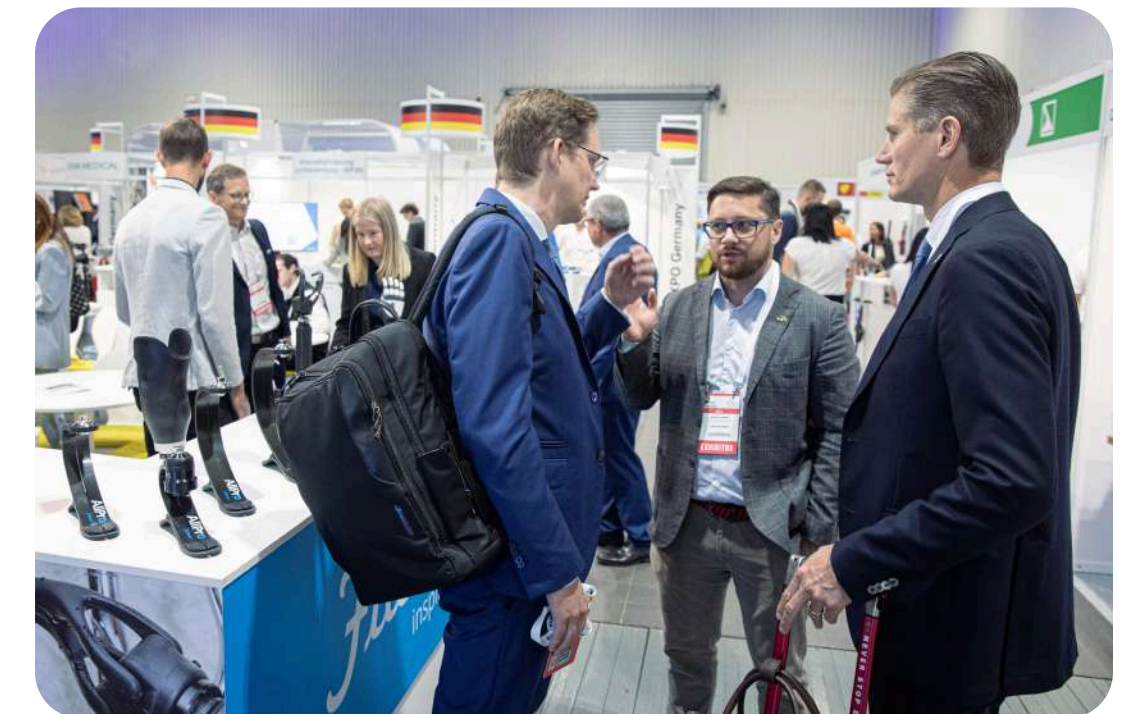
Discussions on grants and funding for 2026