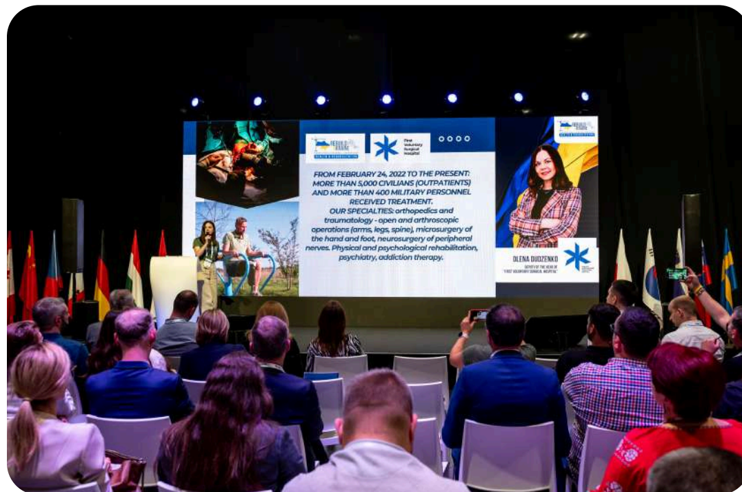
Presentation of real projects from communities and hospitals

ReBuild Health offers a concrete tool – the « Communities Marathon » In 2025, 12 Ukrainian municipalities presented their projects to donors